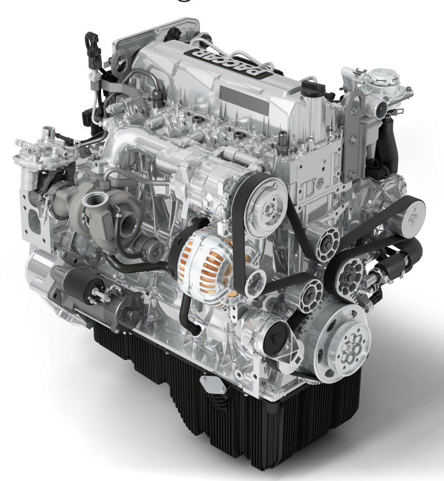
The 3.8 litre Euro 6 PACCAR PX-4 engine uses common rail technology, a fixed geometry turbo and advanced controls for maximum efficiency.